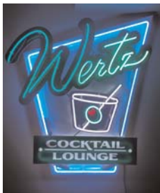
1st Place "Wertz Neon Sign" Badger Display Sign Co., Inc.