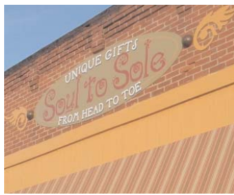
1st Place "Soul to Sole Building Facade" TLC Sign