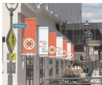
1st Place "City Year - Downtown Milwaukee" Poblocki Sign Co.