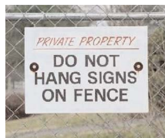
1st Place "File TiM" Lemberg Sign & Lighting