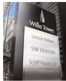
1st Place "Willis Tower - Chicago, IL" Poblocki Sign Company