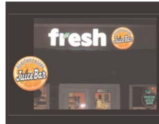
1st Place "Fresh Healthy Eatery & Juice Bar" Lemberg Sign & Lighting