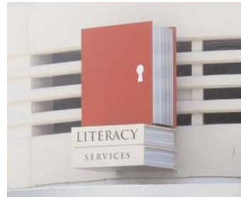
2nd Place "Literacy Services - Milwaukee" Poblocki Sign Co.