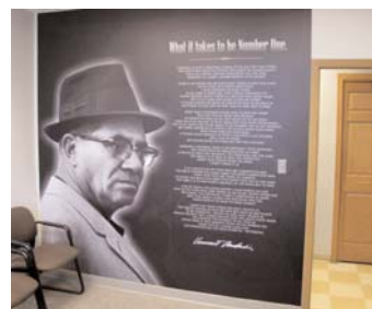
2nd Place "Vince Lombardi Wall Mural" Appleton Sign Company