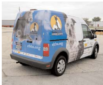
1st Place "Elmbrook Humane Society Vehicle Graphics" Innovative Signs, Inc.