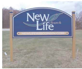
2nd Place "New Life Church" Appleton Sign Company