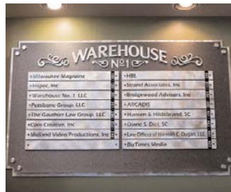
1st Place "Warehouse No. 1 Directory Sign" Innovative Signs