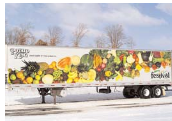
2nd Place "Festival Foods Trailer Wrap" Ron Kemmel Design