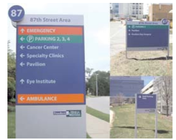
2nd Place "Froedtert Campus Wayfinding" Appleton Sign Company