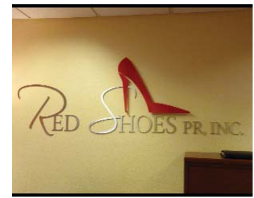
2nd Place "Red Shoes PR Interior ID" Appleton Sign Co.