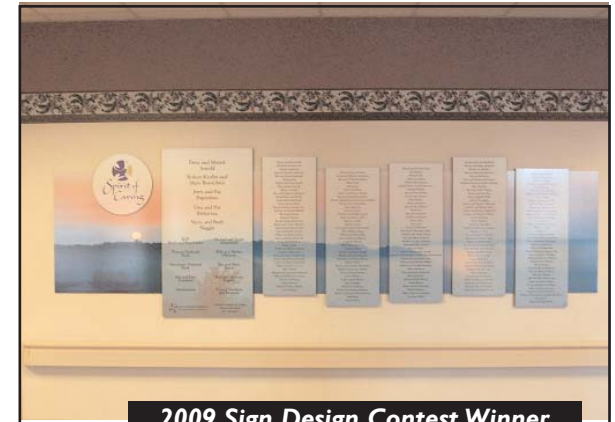
2009 Sign Design Contest Winner

Wisconsin Sign Association, Inc. 11801 W. Silver Spring Drive Suite 200 Milwaukee, WI 53225 (414) 271-9277